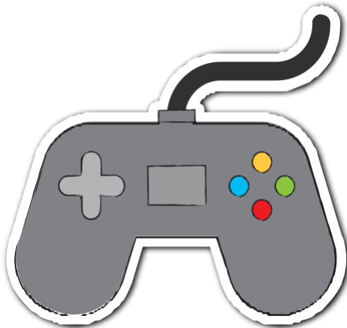
3. Computer game